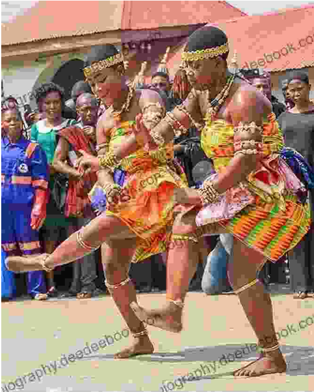
Traditional African dancers showcasing the vibrant cultural heritage of the continent.

Traditional African societies are characterized by a strong sense of community, with extended family and clan systems playing a vital role in everyday life. Respect for elders and ancestors is deeply ingrained, and community members often work together to support each other.