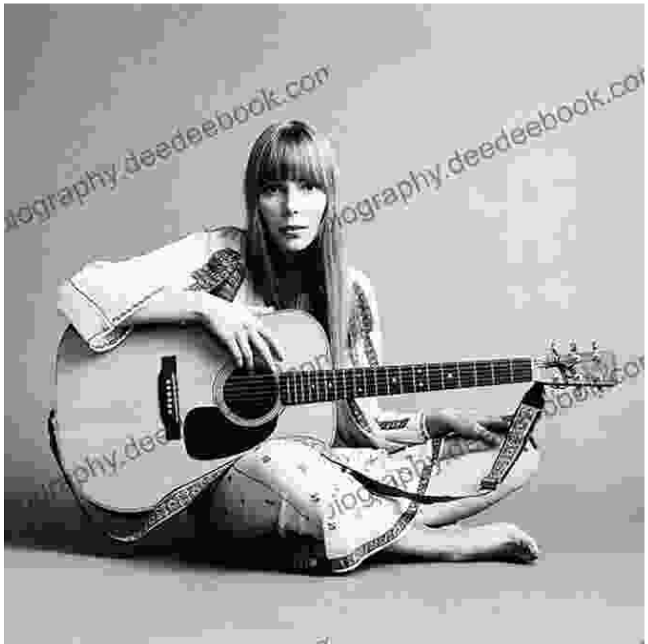
Joni Mitchell in her early days as a folk singer-songwriter, circa 1967.

in coffeehouses and folk festivals, sharing her intimate and introspective songs with an eager audience.