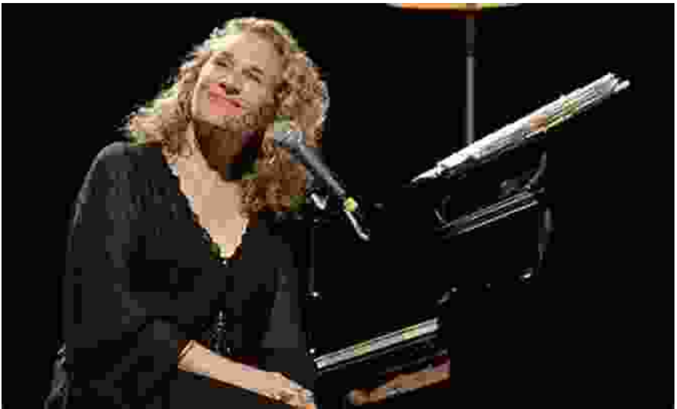
Carole King in her early days as a singer-songwriter, circa 1971.

Carole King's songwriting journey started in the vibrant music scene of New York City. Influenced by the Brill Building era, where songwriting teams churned out pop hits, King honed her craft alongside her then-husband, Gerry Goffin. Together, they penned some of the most iconic songs of the 1960s, including "Will You Love Me Tomorrow?" and "(You Make Me Feel Like) A Natural Woman." King's ability to write heartfelt and relatable lyrics resonated with audiences, establishing her as one of the greatest songwriters of her generation.