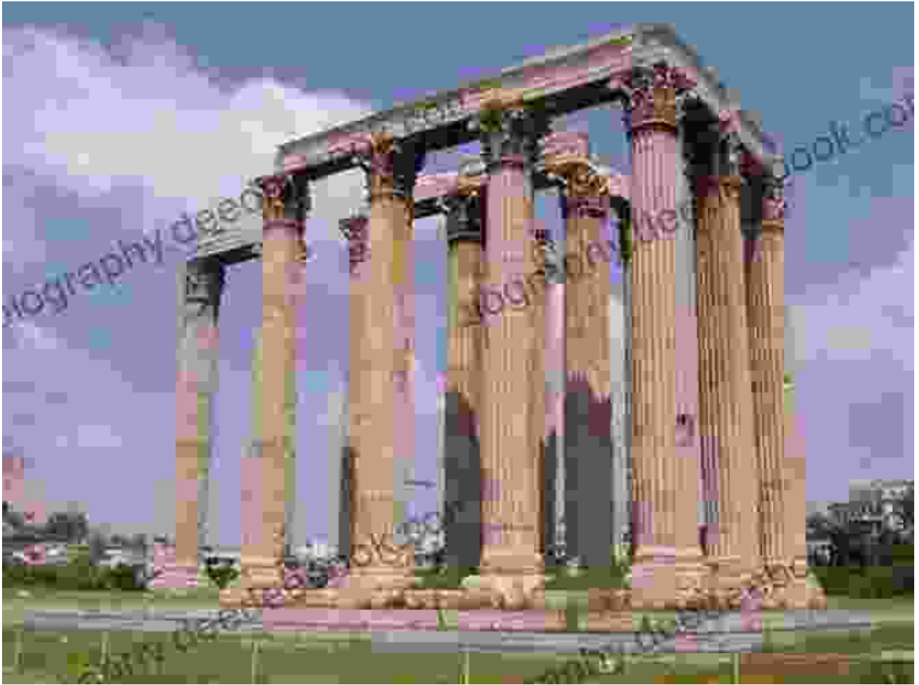
The Temple of Zeus at Olympia, one of the largest Greek temples