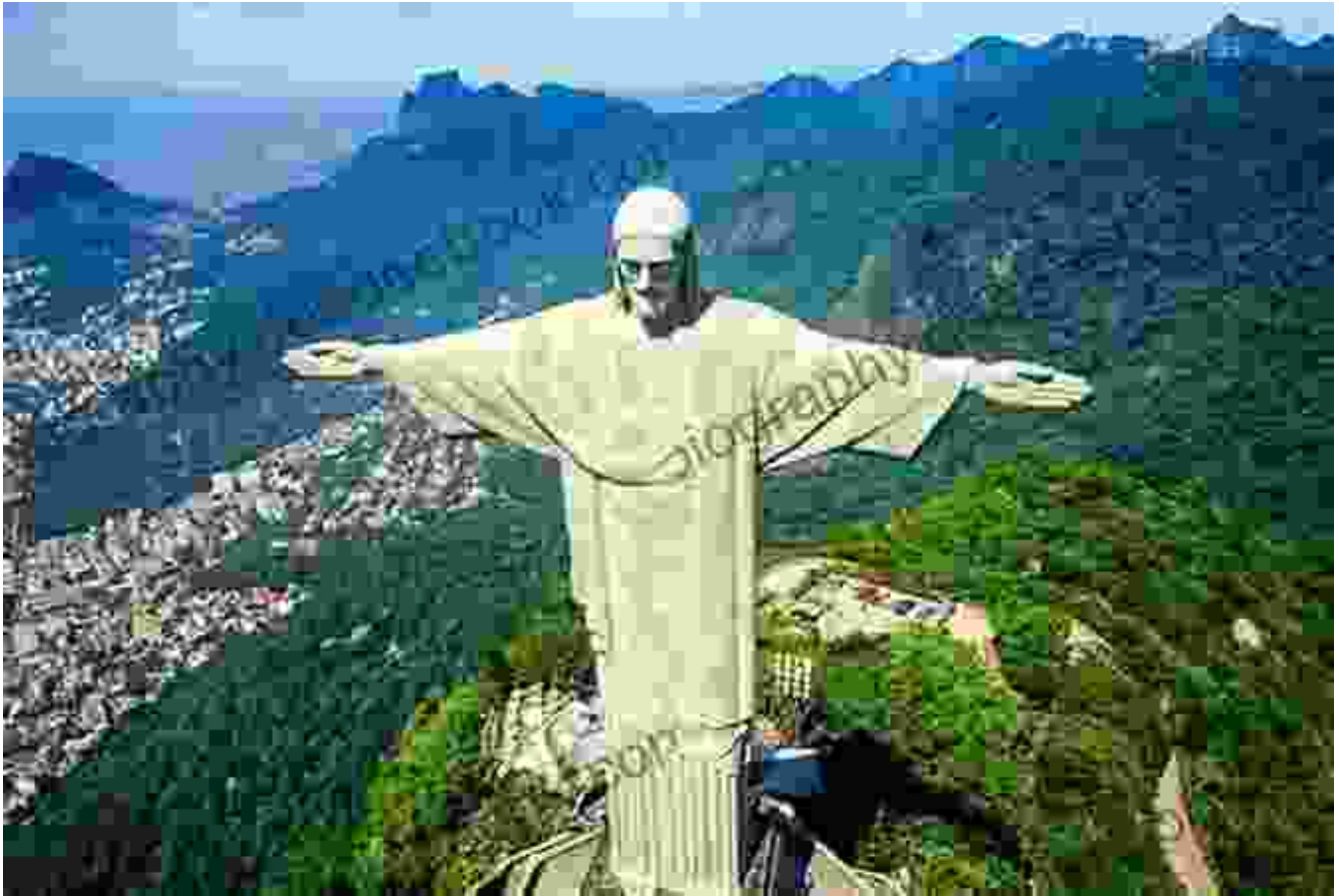
Christ the Redeemer, an iconic statue overlooking Rio de Janeiro

Christ the Redeemer is a 98-foot (30-meter) statue of Jesus Christ overlooking Rio de Janeiro, Brazil. It is one of the most iconic landmarks in the world and a symbol of Christianity. Christ the Redeemer is a popular tourist destination and offers stunning views of the city.