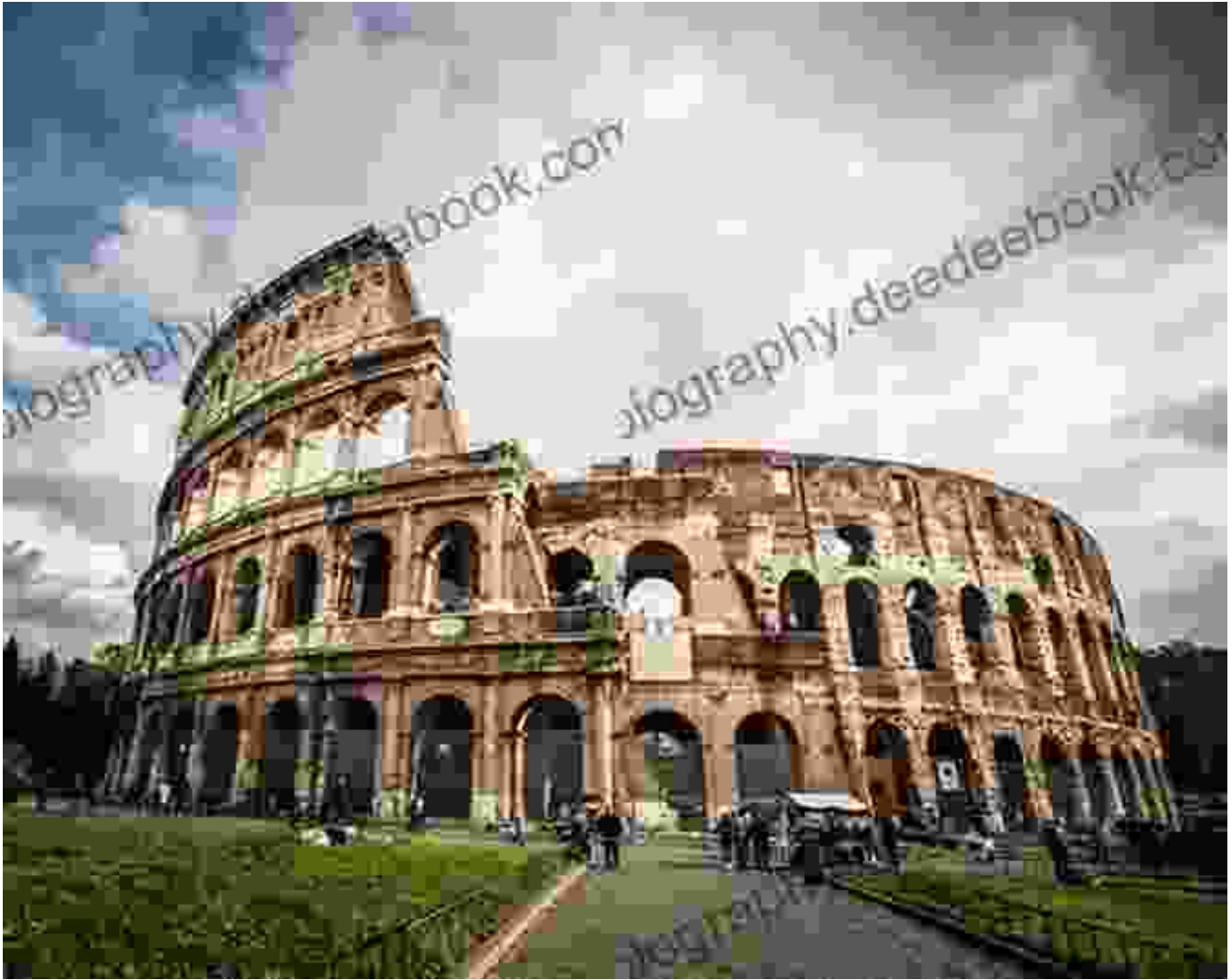
Colosseum, an iconic amphitheater in Rome

The Colosseum is an iconic amphitheater in Rome, Italy. It was built in the 1st century AD and could accommodate up to 80,000 spectators. The Colosseum was used for gladiatorial contests and public spectacles. It is one of the most popular tourist destinations in Italy.