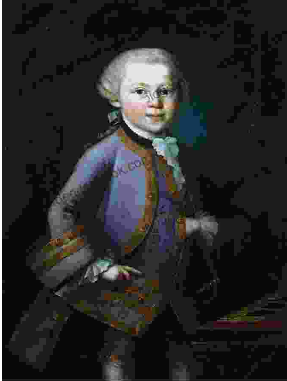
Wolfgang Amadeus Mozart, the Prodigy of the Classical Era

The Classical era witnessed the emergence of Wolfgang Amadeus Mozart, a musical prodigy whose genius manifested itself at an astonishingly young age. Mozart's compositions, marked by their elegance, clarity, and melodic beauty, continue to captivate audiences worldwide. His operas, such as "The Marriage of Figaro" and "Don Giovanni," are considered masterworks