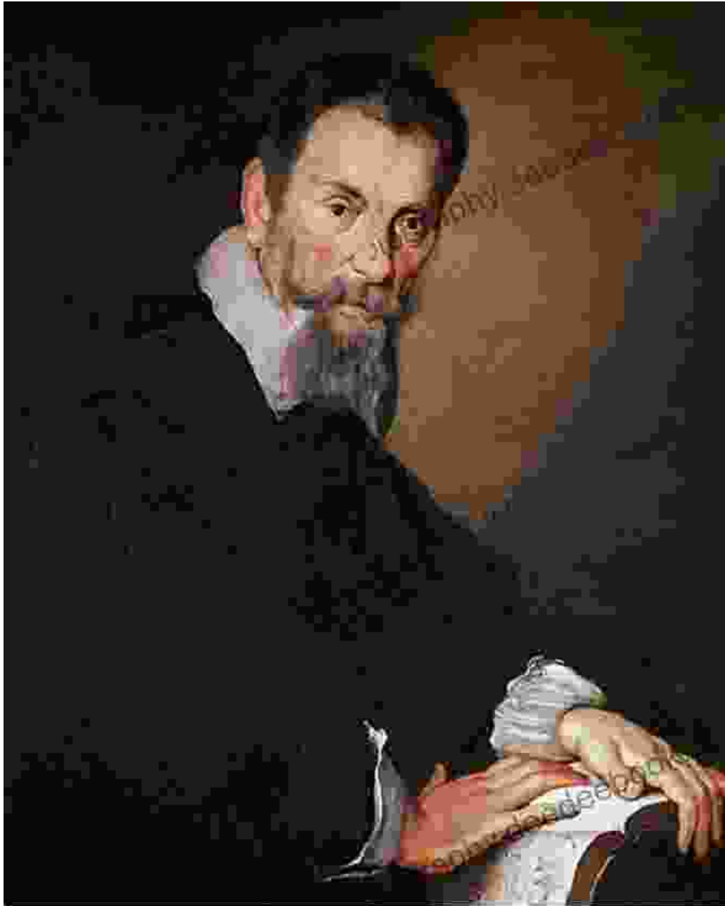
Claudio Monteverdi, the Father of Opera

As the Baroque era dawned, Claudio Monteverdi emerged as a musical visionary who pushed the boundaries of musical expression. Recognizing the transformative power of drama, he pioneered the development of opera, a new genre that combined music, theater, and spectacle. Monteverdi's operas, such as "Orfeo" and "L'Orfeo," shattered conventions