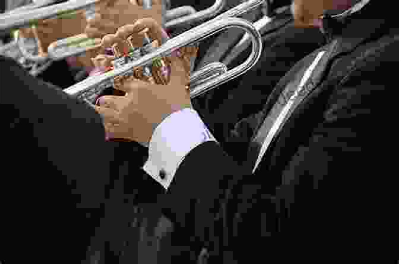
Photo of a person holding a trumpet correctly