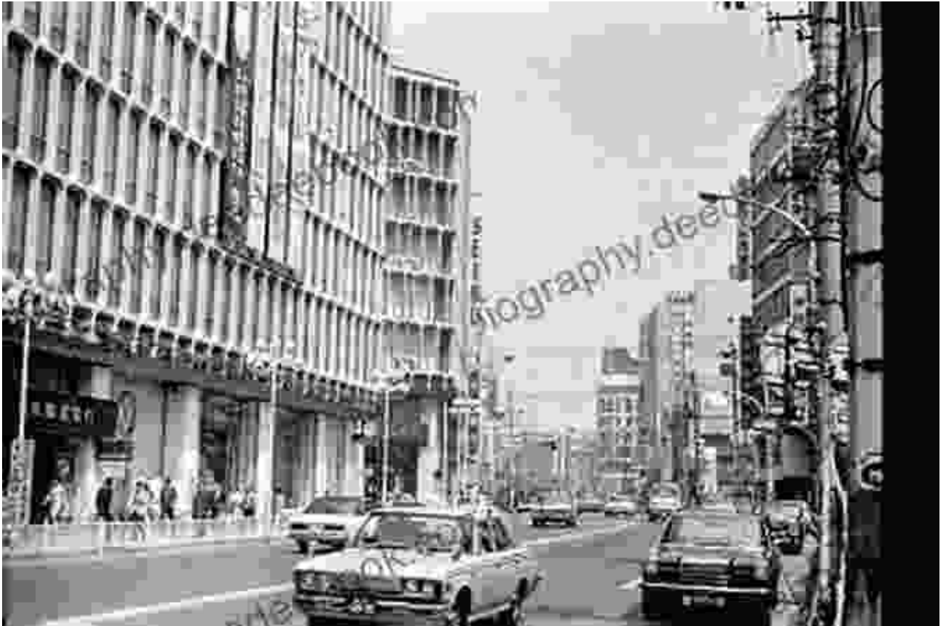
Tokyo during the Showa period