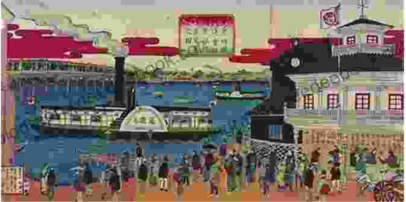
Tokyo during the Meiji period